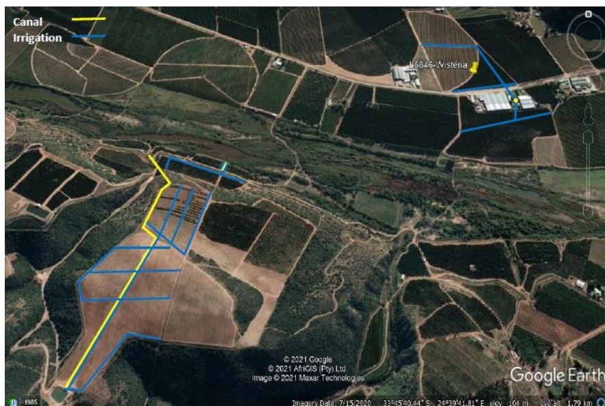
Figure 2: Satellite view of the dam situated on Portion 116 of Andries kraal Farm 89, Eastern Cape Province (image obtained from Google Earth).