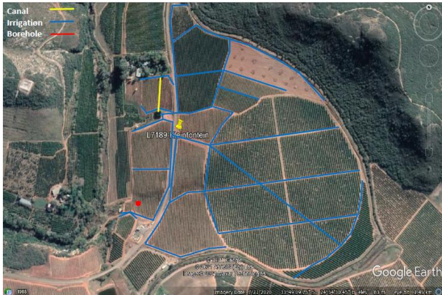
Figure 5: Satellite view of the boreholes situated Portion 40 of 158 Klein Rivier Farm, Eastern Cape Province. (image obtained from Google Earth).