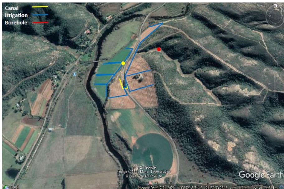
Figure 4: Satellite view of the boreholes situated Portion 46 (Remaining extent) of 436 Farm Loeries River, Eastern Cape Province.